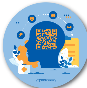
GCP-3500 - 3.5" Circle